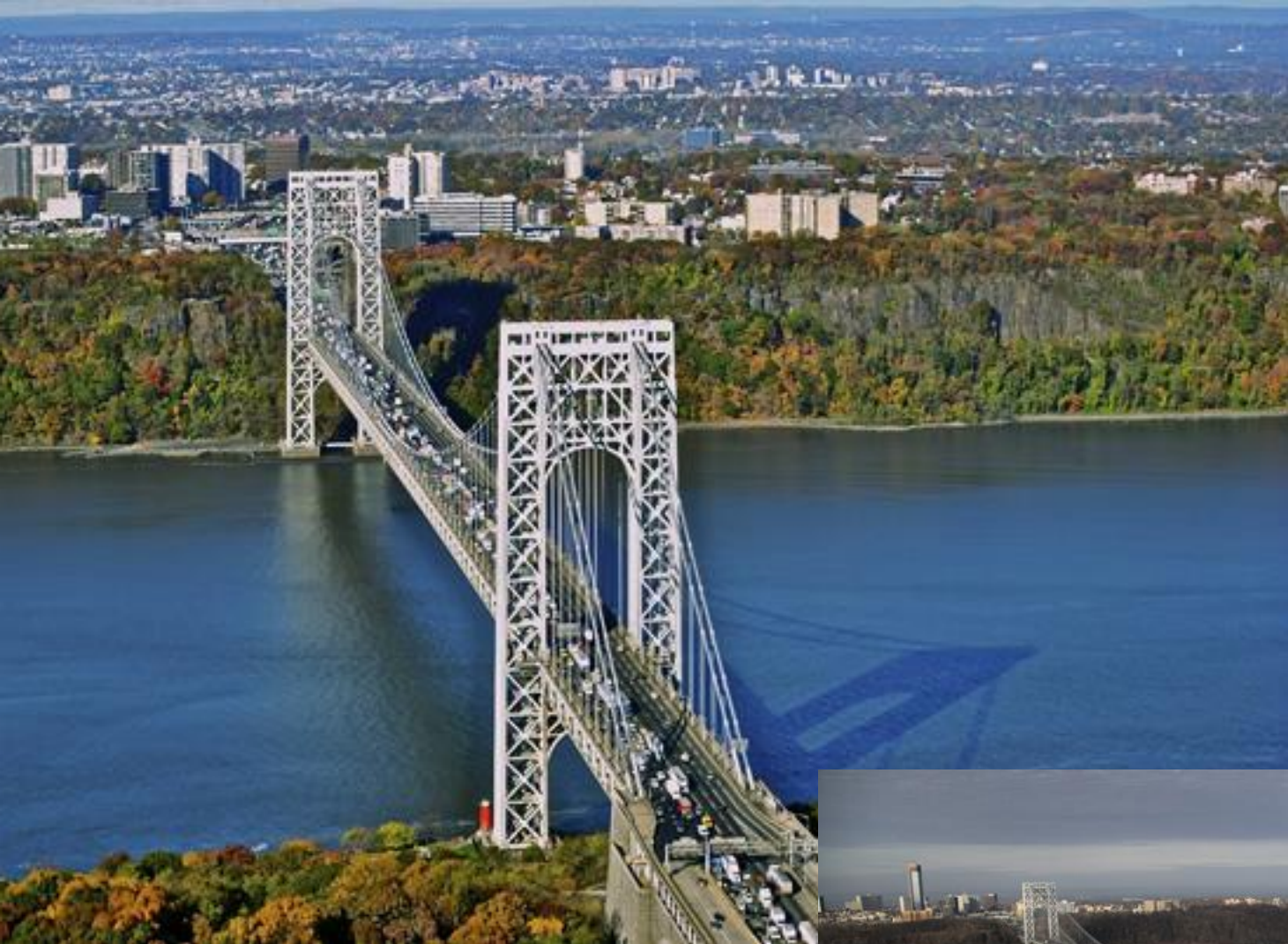
George Washington Bridge Built: 1931 Main Span: 3500ft