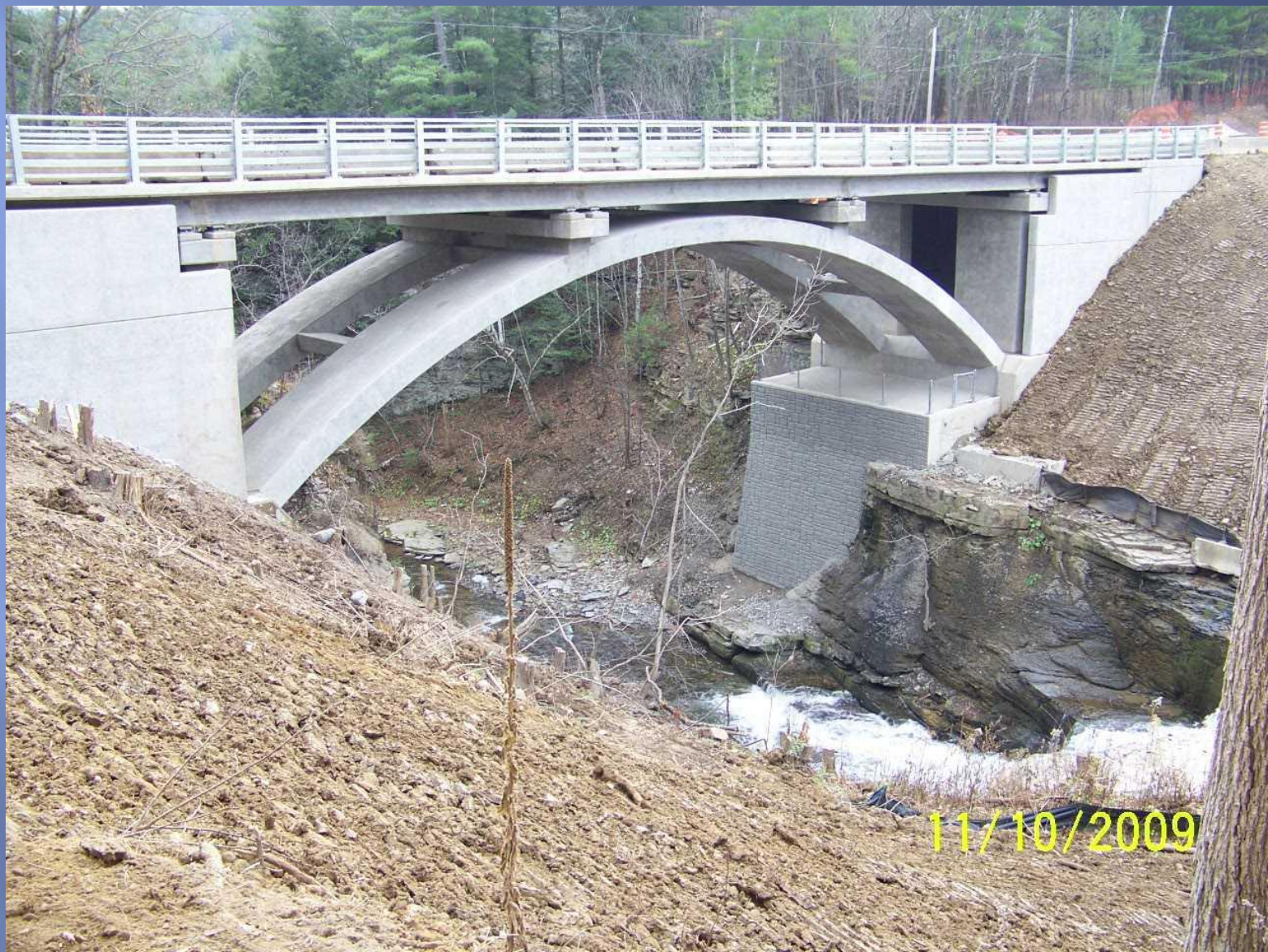
Rt. 30 over Mine Kill Built: 2009 Span: 159 ft