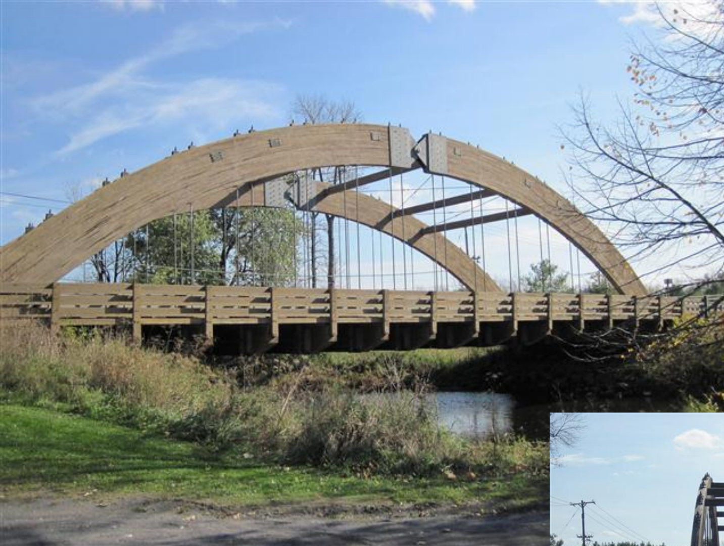
County Route 27 over Little River Built: 1994 Span: 139 ft