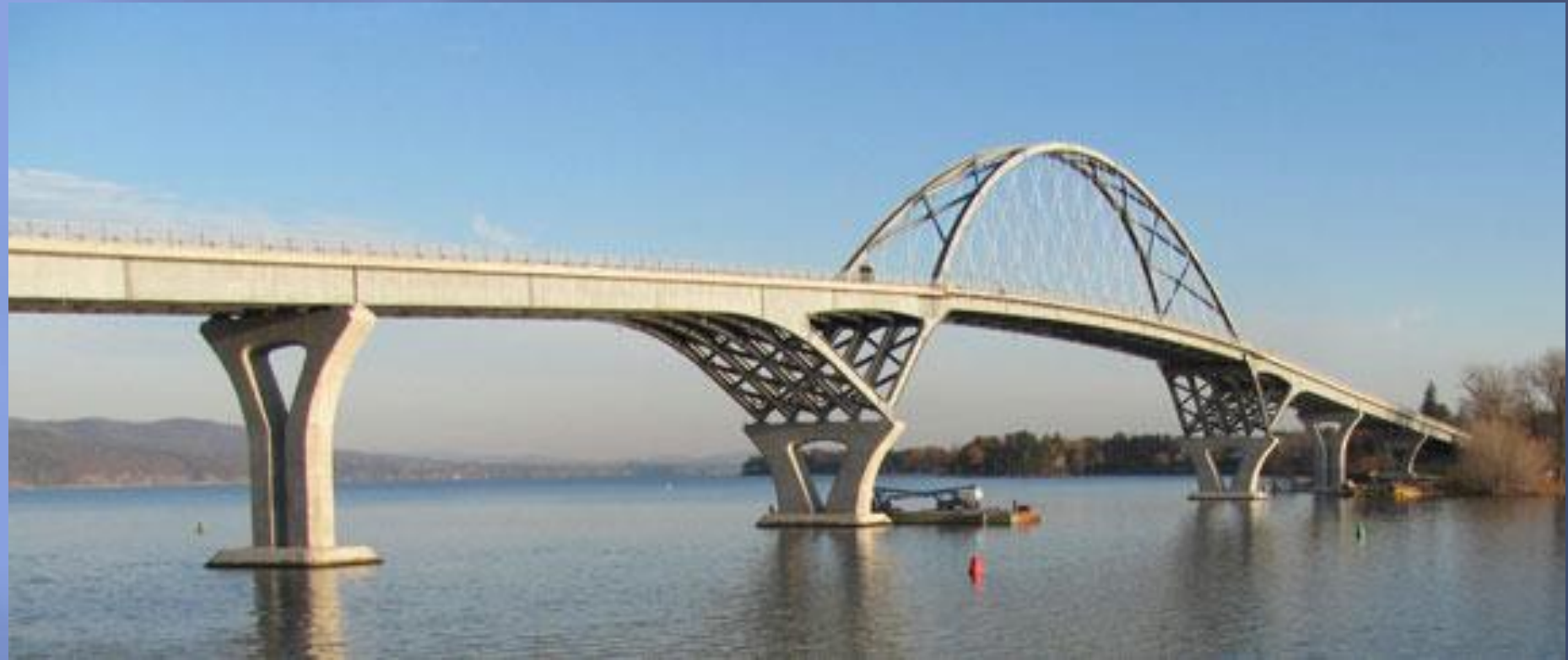
Lake Champlain Bridge Built: 2011 Main Span: 2200 ft